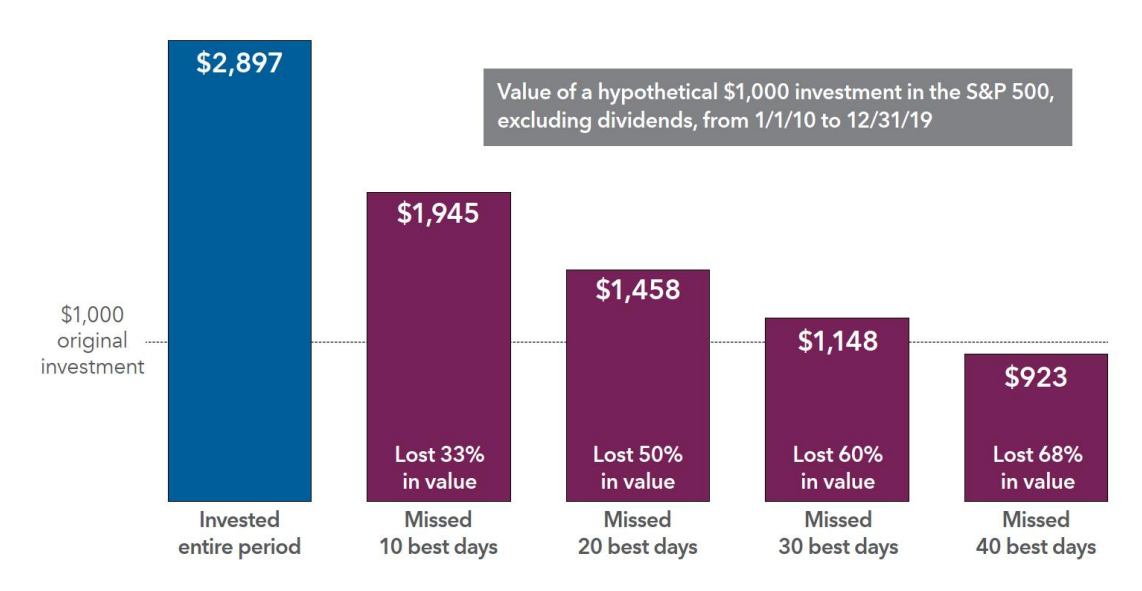
Missing just a few of the market's best days can hurt investment returns

When we think about successful long-term investing, it's time in the market, not timing the market that matters. Missing just the 10 best days of a recovery would significantly hurt one's long-term return. Missing additional "good" days, results in even lower returns. The next graph illustrates the impact of missing the best days during the previous decade: